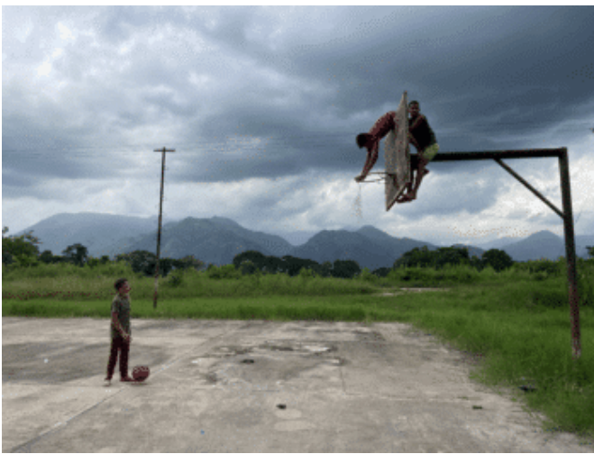
August 2023. Children at the Cinco Fortalezas commune in Sucre, Venezuela, install a new basketball net.

electoral process. But not only has this rhetoric proved, again and again, to be false—Trump himself dispelled the myth, declaring in June 2023: “When I left [office], Venezuela was ready to collapse. We would have taken it over. We would have gotten all that oil. It would have been right next door.” This declaration echoed a statement made by his secretary of state Mike Pompeo four years earlier that “We always wish things could go faster.... The circle is tightening, the humanitarian crisis is increasing by the hour.... You can see the increasing pain and suffering that the Venezuelan people are suffering from.”