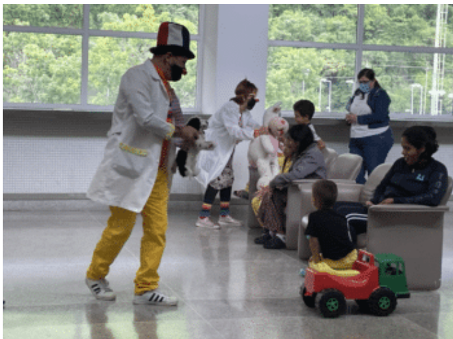
July 2023. Clowns carry out their weekly rounds to entertain children in a waiting

Three years later, UN Special Rapporteur Douhan released a report on the impact of unilateral coercive measures in Venezuela, concluding , among other key points, that “the tightening of sanctions from 2017 undermined the positive impact of the multiple reforms and the State’s capacity to maintain infrastructure and continue to implement social programmes.” The report shows, for example, that as a result of these measures, the children’s heart hospital, which Douhan refers to as the most modern in the country and which handles 90 percent of children’s heart operations nationwide, decreased its surgeries by 94 percent from 2015 to 2020. Meanwhile, at the J. M. de Los Ríos children’s hospital in Caracas, the main hospital treating children from outside the capital, “care in several of its 34 specialist areas is reportedly no longer available. The hospital lacks basic medicine, medical equipment and instruments, and can no longer provide food for the patients. Patients requiring oncology and haematology services cannot receive complete treatment, which has forced families to seek supplemental treatment elsewhere—if they can afford it. Here again, the poorest are the most affected.”