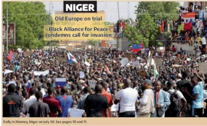
Rally in Niamey, Niger on July 30. See pages 10 and 11.

No mention is made of Trump's continuing occupation and bombing of Syria. Or his other war crimes, like the assassination of Iranian Gen. Qassem Soleimani, who was on a dip-