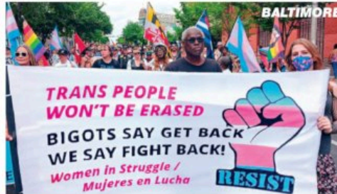
Solidarity and defiance at Trans Pride March. See page 3.