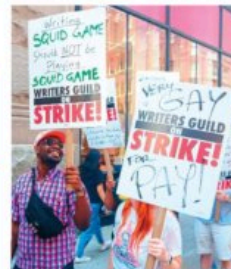
'Pride on the picket line'