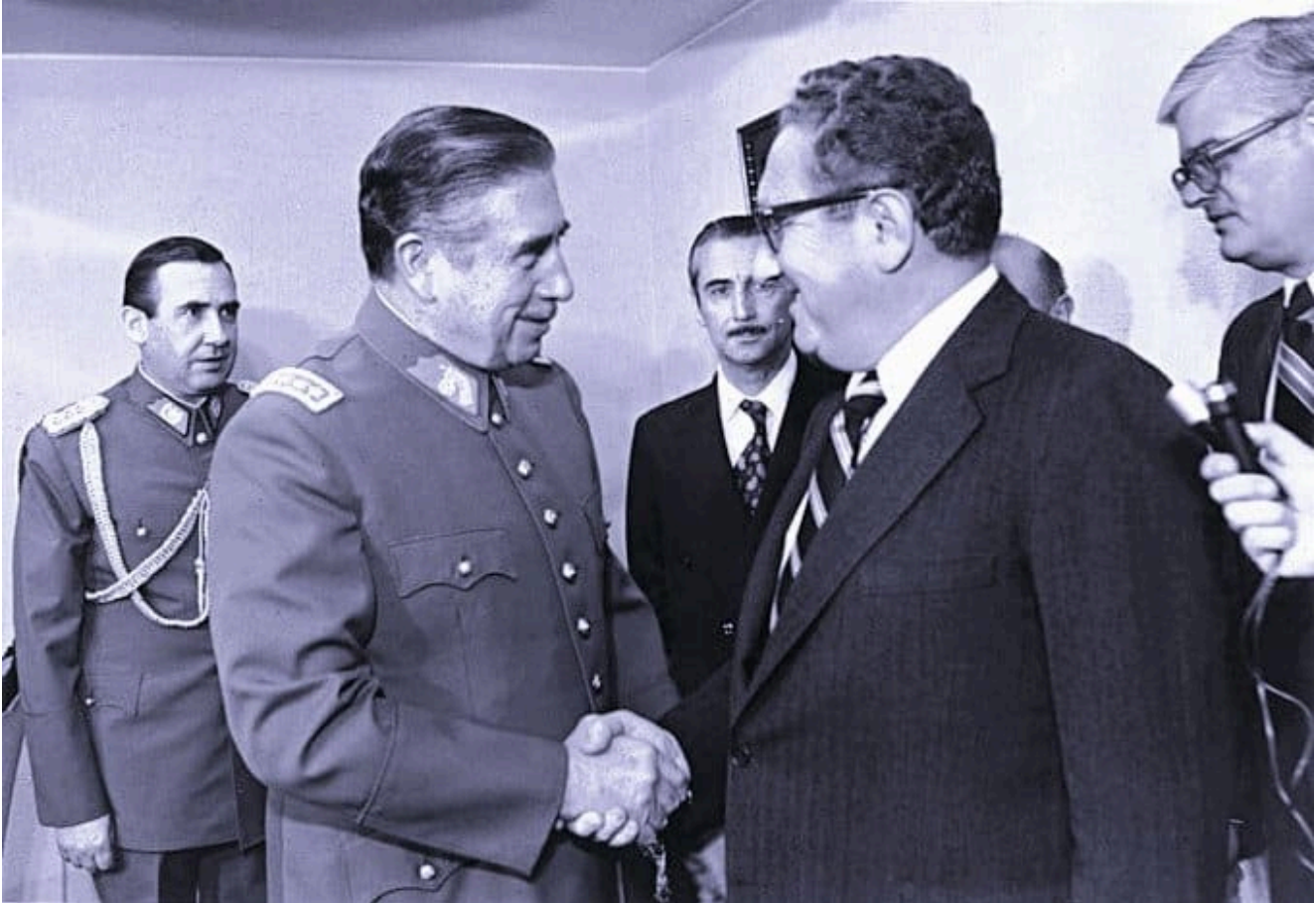
Chile's ruler Augusto Pinochet meeting U.S. Secretary of State Henry Kissinger in Santiago, June 8, 1976.