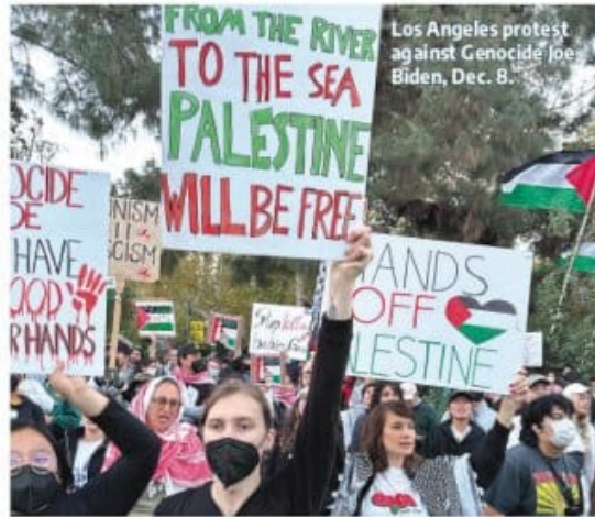
Los Angeles protest against Genocide Joe Biden, Dec. 8.