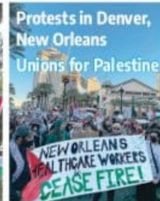
Protests in Denver, New Orleans Unions for Palestine

Detention in Egypt Jewish people fight for Palestine U.S. war spending End anti-Muslim bigotry