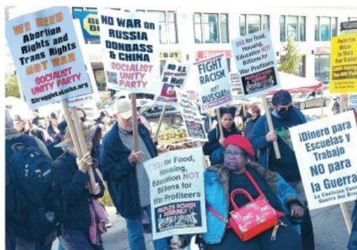
Protest in the Bronx, N.Y., Oct. 15.