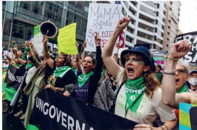
Washington, D.C., July 9.

On July 8, protesters organized by the Louisiana Abortion Rights Action Committee took over the streets in front of the Civil District Court in New Orleans where a hearing about Louisiana’s anti-abortion “trigger laws” was being heard.