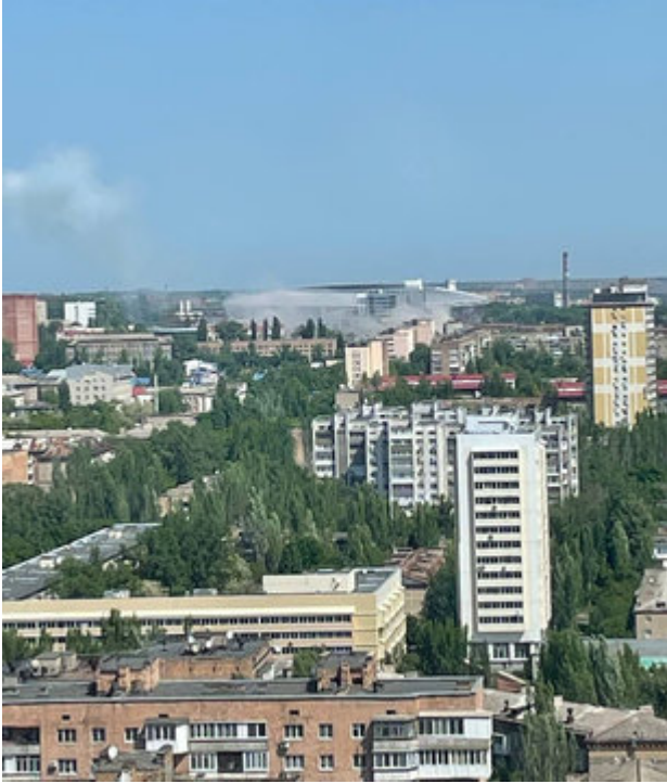
Arrivals in the center of Donetsk.