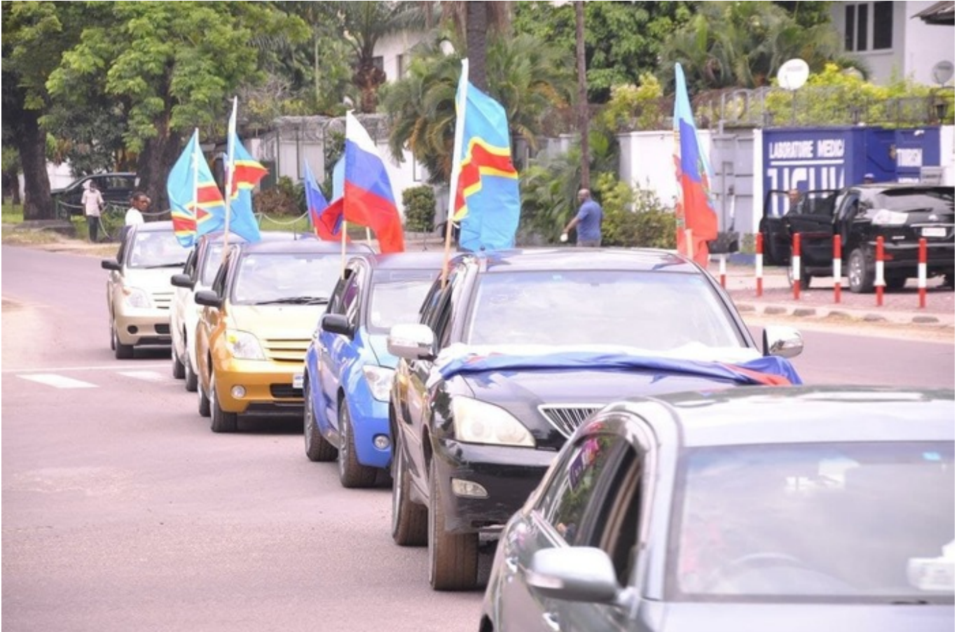
Car rally in the Democratic Republic of Congo in solidarity with Donbass and Russia, Feb. 22.

Actions in support of Russia's recognition of the Donbass republics and the joint military operation have been held by movements in the Democratic Republic of Congo, Italy and Serbia .