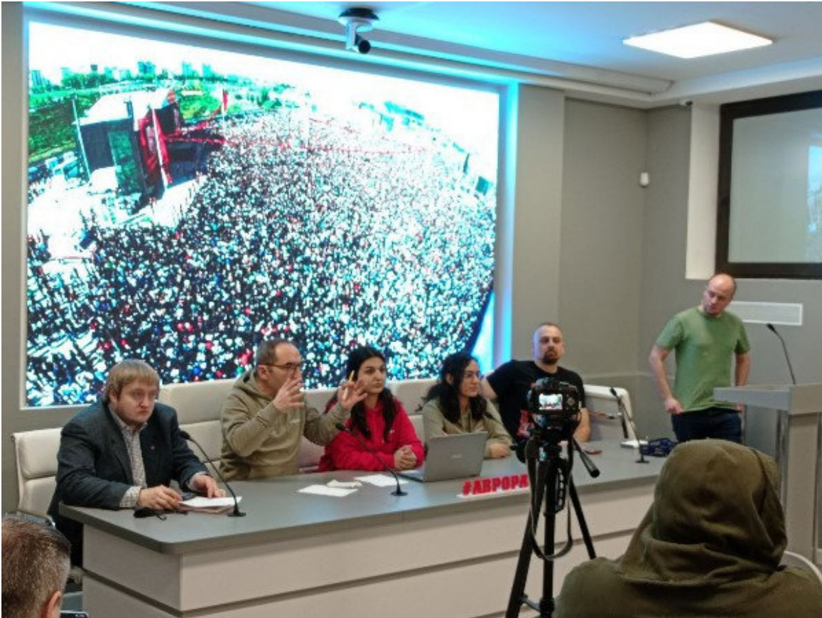
Moscow news conference with Grup Yorum, Feb. 21.

To hear the U.S. corporate media tell it, the entire world has joined Washington in condemning Russia's recognition of the Donetsk and Lugansk People's Republics in Donbass and their joint anti-fascist military operation in Ukraine. But in reality, nothing could be further from the truth.