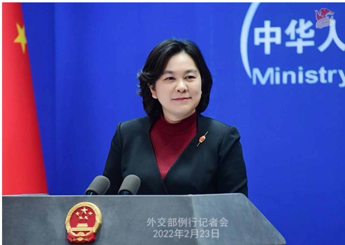
Chinese Foreign Ministry spokesperson Hua Chunying.