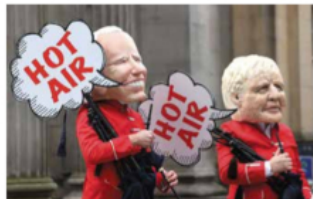
Protesters dressed as President Joe Biden and British Prime Minister Boris Johnson at a climate demonstration in Glasgow, Nov. 1.

The Build Back Better spending bill was initially proposed with a price tag of $3.5 trillion. Along with a handful of