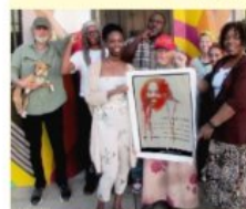
Members of San Diego Coalition to Free Mumia.