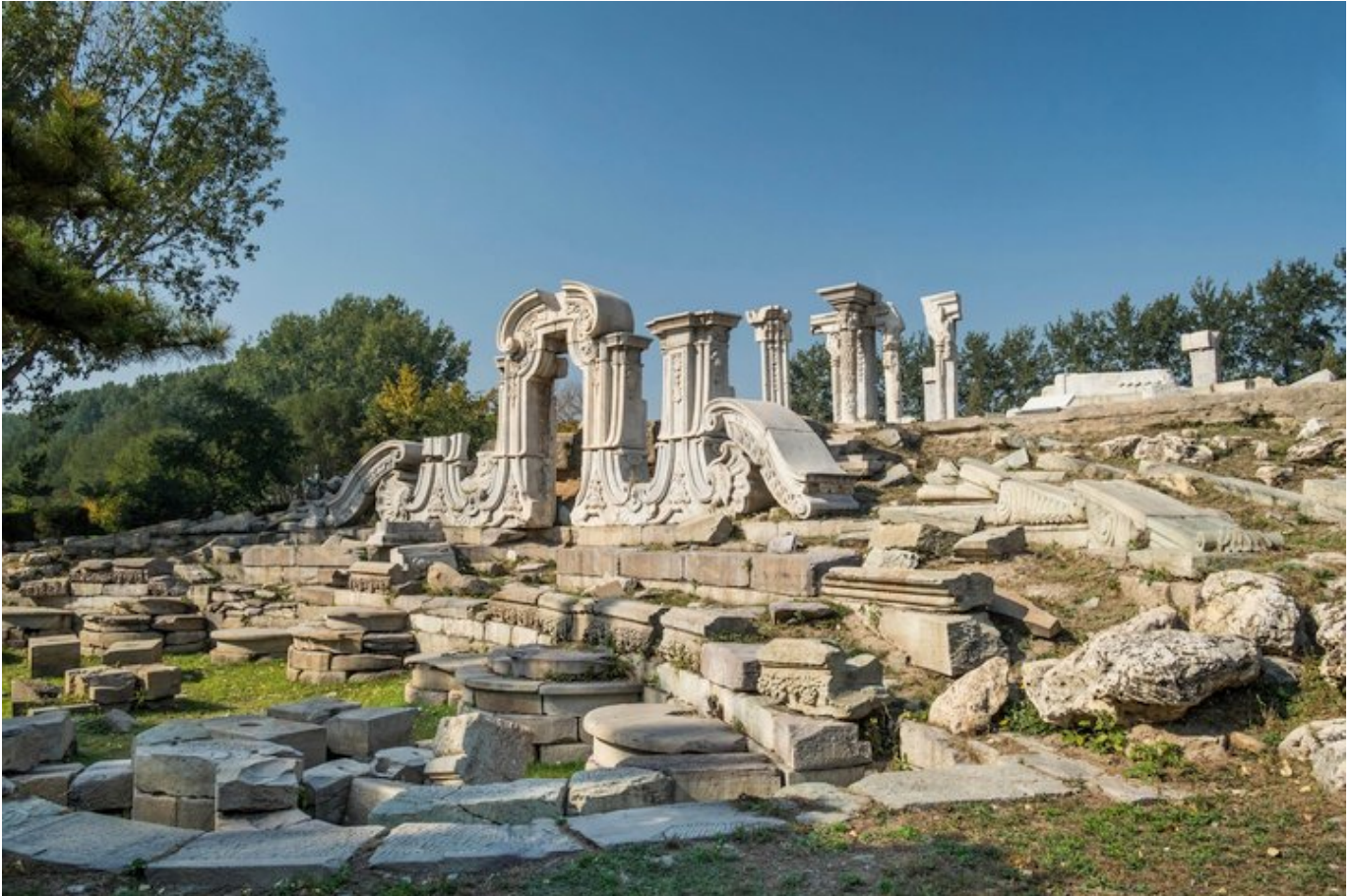
Ruins of the Old Summer Palace in Beijing, looted by the British Army during the

As a result of this massive vandalism, GM's stock price almost doubled over the next two years.