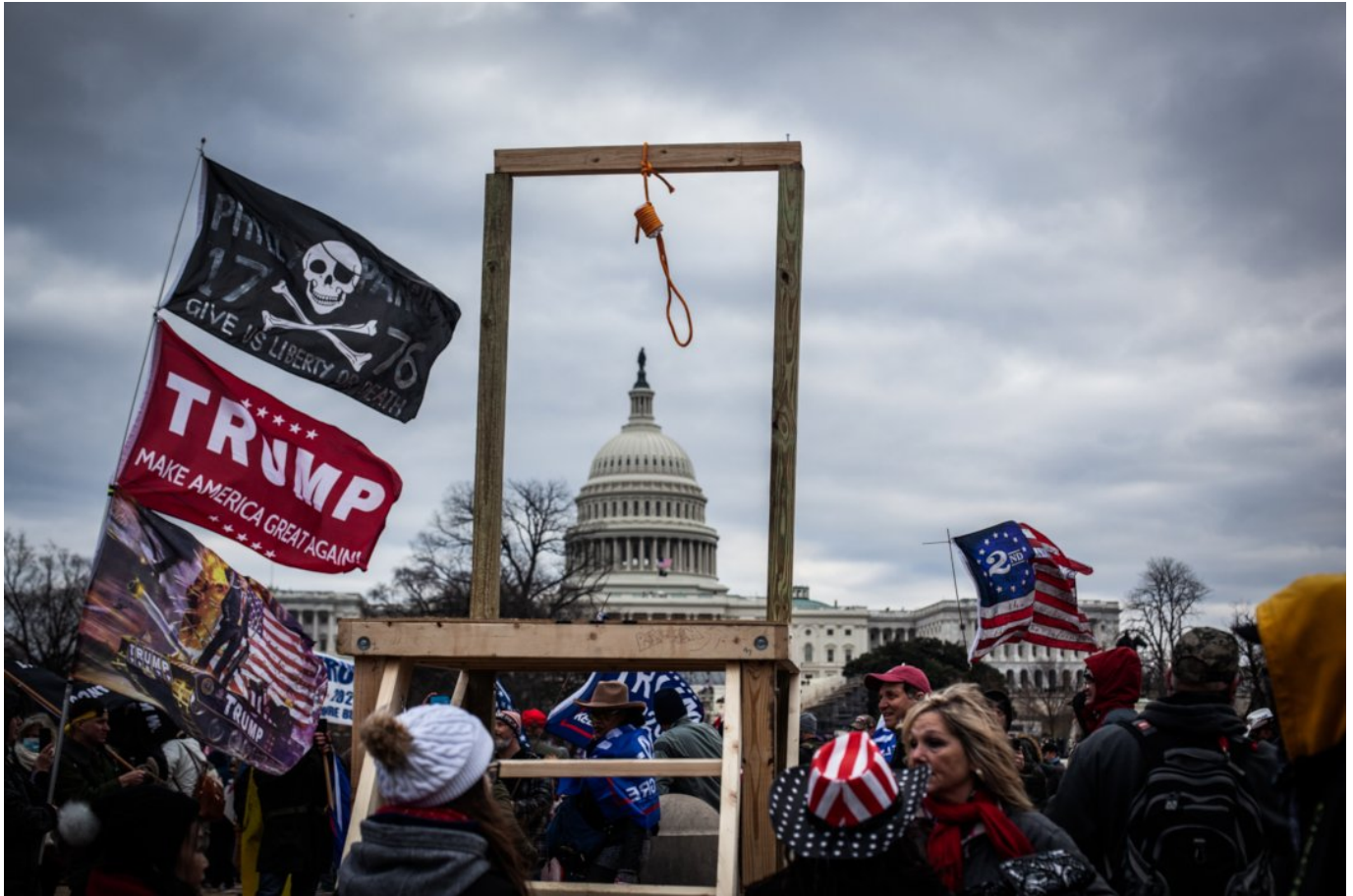
A noose is erected by supporters of President Donald Trump on the West side of the Capitol in Washington, DC, on January 6, 2021.