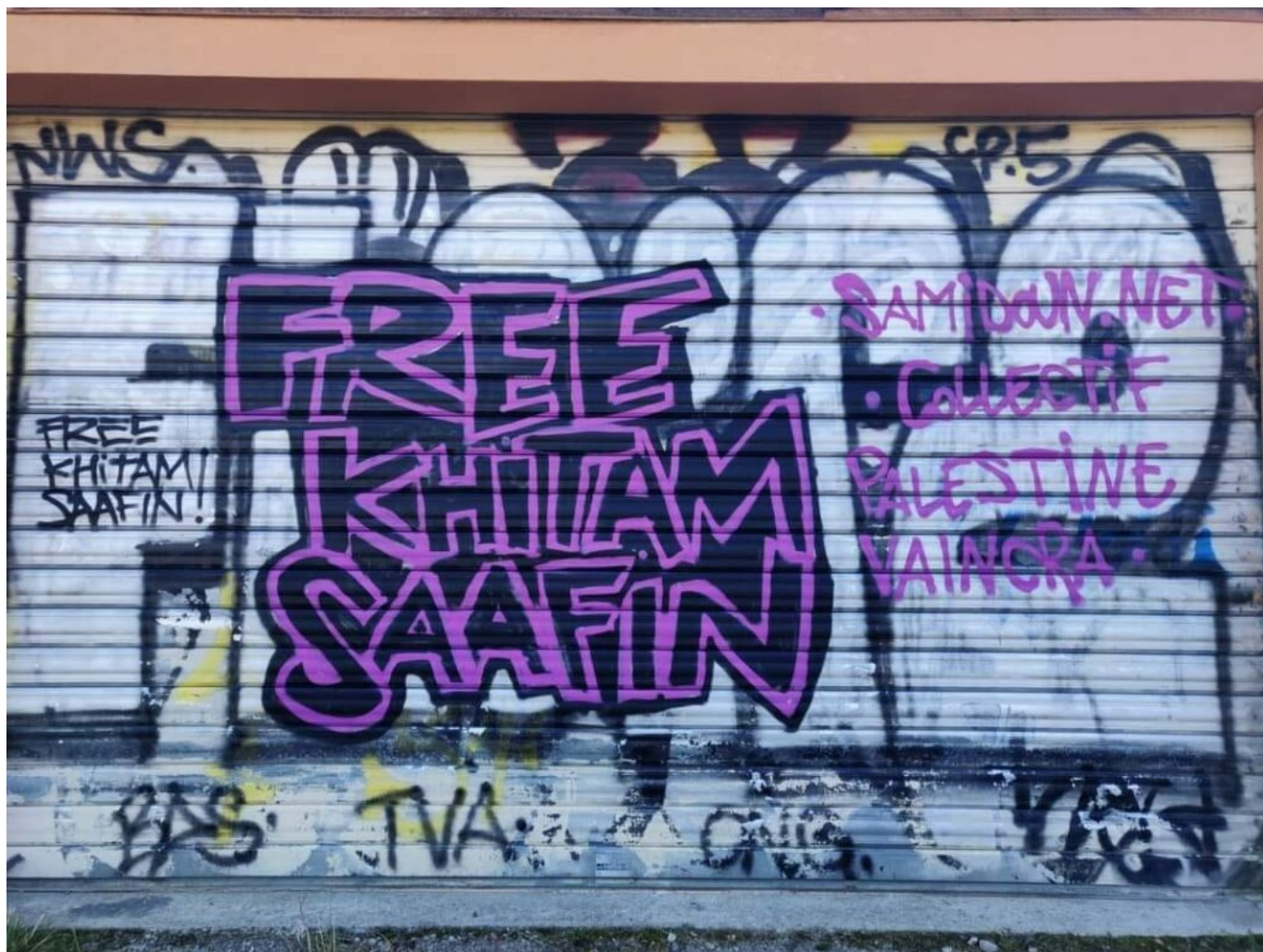
Photo: Toulouse, France, via Collectif Palestine Vaincra (Facebook)