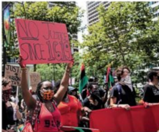
Philadelphia, July 4, 2020.

The second-largest banking group in the U.S. is