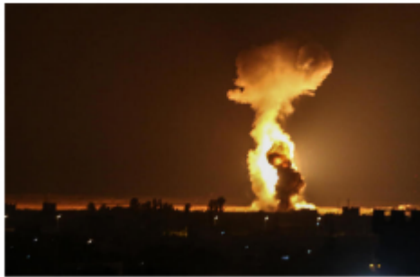
Smoke and flames rise after war planes belonging to the Israeli army carried out airstrikes over the southern Gaza Strip city of Rafah, August 12, 2020.

AFP ( CBS , 8/13/20 ) describes attacks on Gaza as “the latest retaliation against fire bombs suspended from balloons that have been released from the Palestinian territory.”